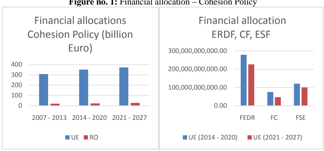
Figure no. 1: Financial allocation – Cohesion Policy

Upon a closer analysis, compared to the 2014-2020 programming period, the Cohesion Policy will have a higher allocation during the 2014-2020 programming period, but the funds allocated to the ERDF, ESF + and CF will decrease.